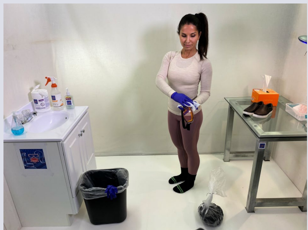
9. Disinfect Goggles for Re-Use