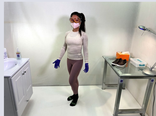
4. Remove Shoes