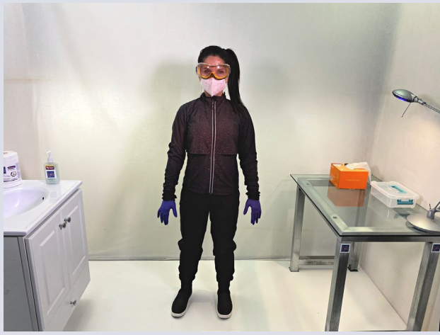
1. Virus Laden Worker in Practical PPE Outfit