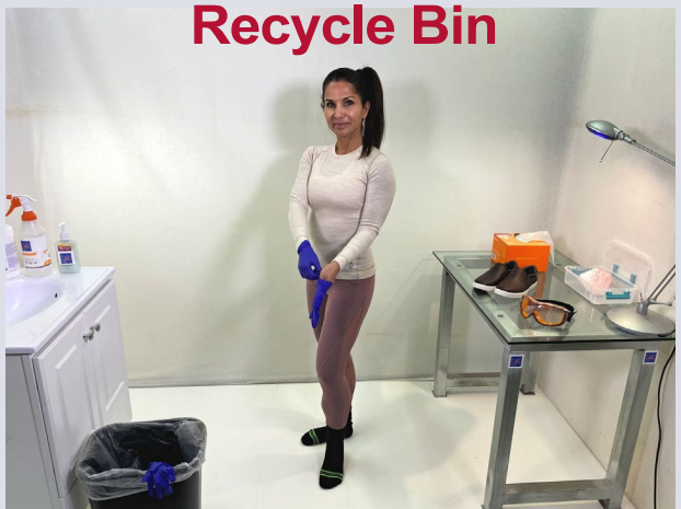
7. Put on New Gloves and place your Mask in a Recycle Bin