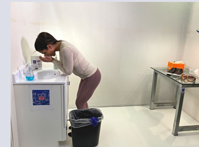
6. Thoroughly Clean Face, Neck & Hands with Soap & Water