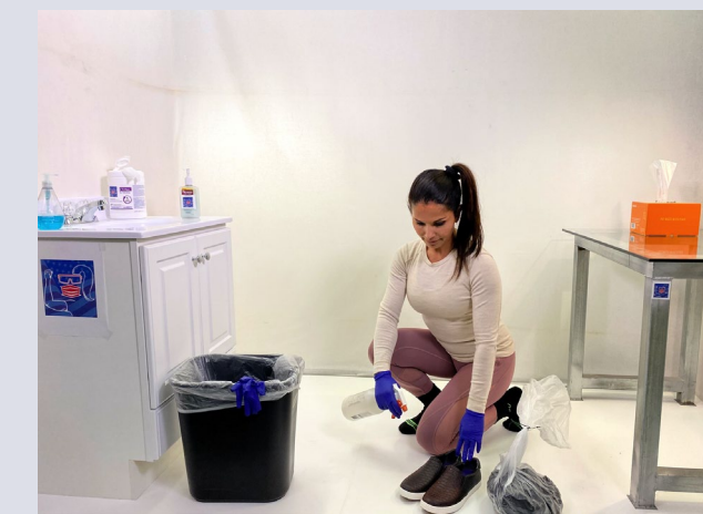
10. Disinfect Shoes & Leave to Dwell for Re-Use