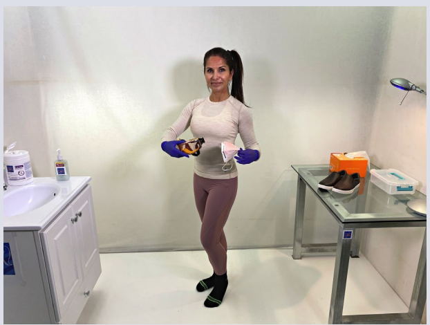
5. Remove Mask and Goggles