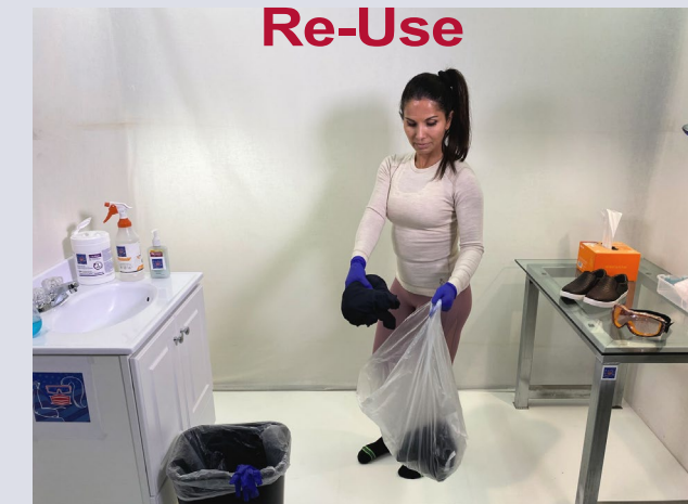
8. Place Contaminated Clothing in a Laundry Bag for Re-Use